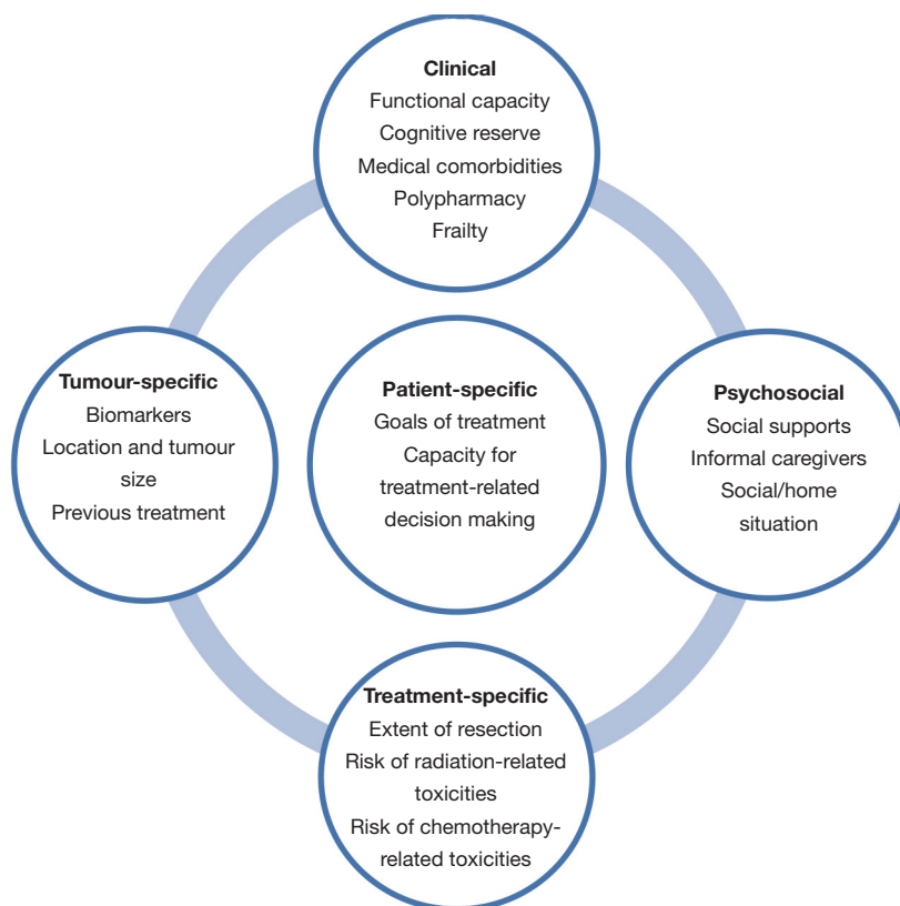
Figure 1 Treatment planning in elderly patients with glioblastoma