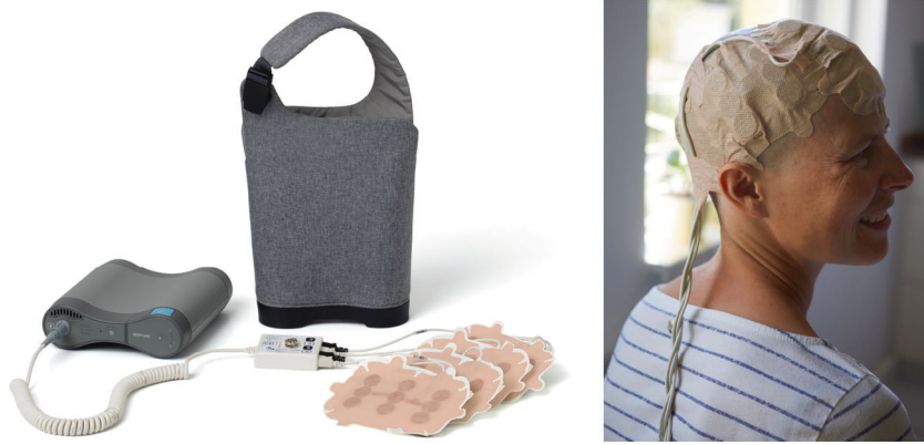
Fig. 2 The Optune system. Left: the Optune TTFIELDS delivery system consists of four transducer arrays, a field generator and a power source. Right: a patient wearing the Optune system. 36

with another expressed as cost per LYG) to be €549,909 and €510,273, respectively. Both studies analysed survival using statistical models that were unable to account for changing (decreasing) hazard rates as patients live longer. This is an important limitation since epidemiological data suggest that as a patient survives longer, the ongoing probability of death reduces. For example, analysis of the US SEER database demonstrated patients alive 5 years after diagnosis had a 70.4% probability of surviving to 10 years post diagnosis. 30 Therefore, although data from the EF-14 trial suggest that addition of TTFIELDS may increase 5-year OS from 5% to 13%, the studies by Bernard-Arnoux et al. and Connock et al. did not fully account for the impact of long-term survivors beyond the trial period. This resulted in reported incremental lifetime survival benefits (the LYG) close to the median OS benefit observed within the trial period. By contrast, Guzauskas et al. integrated EF-14 data with external GBM epidemiology data and US life expectancy data to estimate long-term conditional survival (similar integration of oncology trial and epidemiological data to model long-term survival has previously been considered by NICE in its decision to licence ipilimumab for metastatic melanoma 31,32 ). Consequently, the Guzauskas model estimates 1.25 LYG from adding TTFIELDS to TMZ and estimates a corresponding ICER of $150,452.