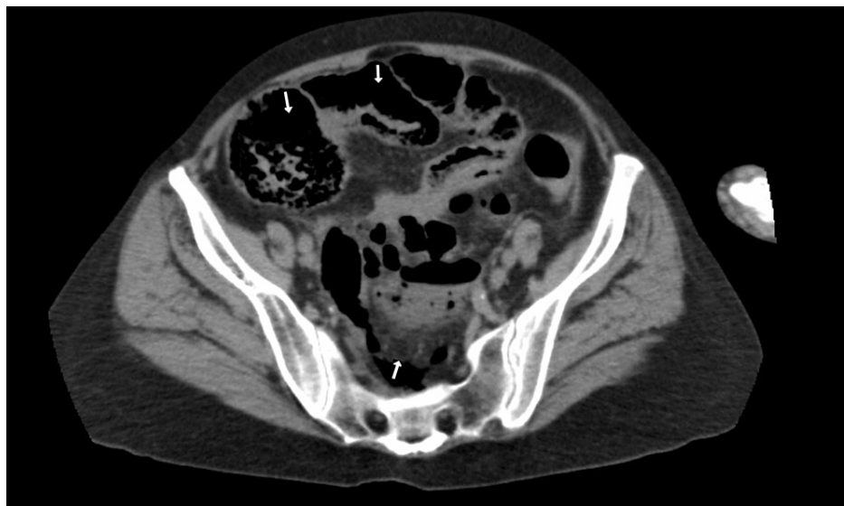
FIGURE 2: CT Scan Abdomen and Pelvis without contrast - Cross-sectional view- Air in the peritoneum due to intestinal perforation