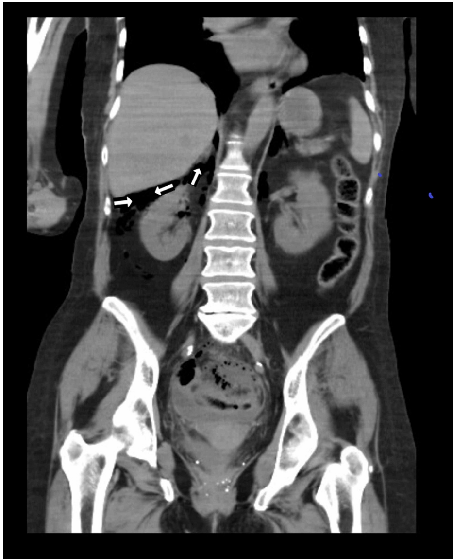
FIGURE 3: CT Scan Abdomen and Pelvis without contrast- Coronal View- Showing air under the liver from intestinal perforation.