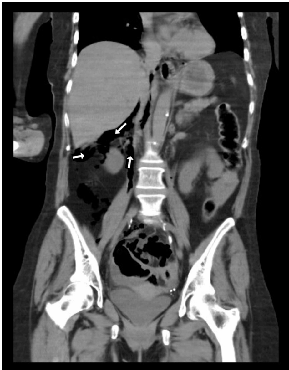
FIGURE 4: CT Scan Abdomen and Pelvis without contrast - Coronal View- Showing Air under the liver and Peritoneum from intestinal perforation.

A stat consultation with the surgical team was obtained, and the condition of the patient was discussed with the patient's oncologist and husband. As per the patient's wishes, comfort care was initiated. The patient eventually succumbed in the hospital couple of days into hospitalization.