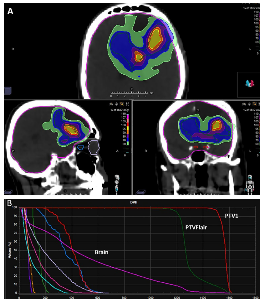
FIGURE 1 | Examples of (A) dose distribution and (B) typical dose volume histogram (DVH) for a prescription dose of 15 Gy in 3 fractions to PTV1 and 12 Gy in 3 fractions to PTV FLAIR.

In patients in whom PTV FLAIR was delineated, a total dose of 12 and 20 Gy was delivered (99% isodose line covering 99% of the PTV); 15 Gy and 25 Gy were prescribed to the PTV1 in 3-5 daily fractions at the isodose of 67% ( Figure 1 ). The treatment dose was chosen on the basis of the Karnofsky Performance Status (KPS) of the patient, the interval between the first and second radiotherapy course, tumour size, and the proximity of critical organs to the targets. All patients underwent image-guided helical TomoTherapy (HT) (TomoTherapy Inc., Madison, WI, USA). The HT system uses image-guided RT in which a CT scan is performed before each treatment, allowing the radiotherapist to verify and adjust the patient's position as needed to ensure that the radiation is directed exactly at the target area.