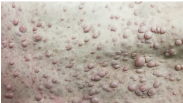
Figure 1. Multiple café-au-lait spots and neurofibromas were found in patient's back.

The admission physical examination showed stable vital signs (body temperature: 36.8°C; heart rate: 86 beats per minute; respiration rate: 19 breaths per minute; blood pressure: 91/50 mm Hg, 1 mm Hg = 1.33 KPa). No obvious abnormality was found in cardiac, lung, and abdominal examination. The patient was in consciousness and cooperative in answering questions. The bilateral pupils were sensitive to light reflection with equal shape and size. The bilateral eyes exhibited free movement. Multiple café-au-lait spots and neurofibromas were found over patient's chest, neck, back, and arms (Fig. 1). The shallow left nasolabial groove, drooping left eyelid and disappearance of forehead line were found in the patient's face. No hypoesthesia or hyperesthesia was found in the patient's face, body, and limbs. The myodynamia of left distant and proximate epipodite were