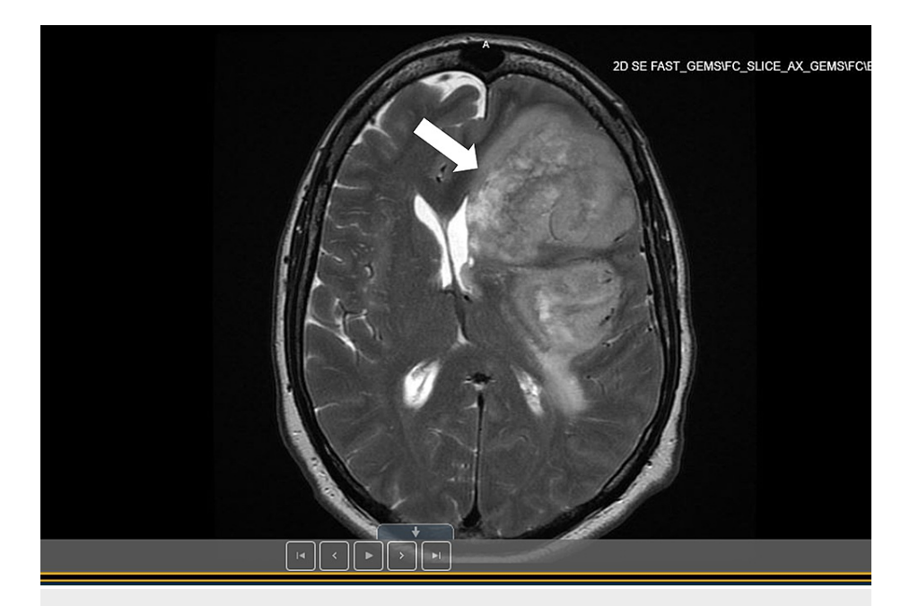
FIGURE 1: MRI of the brain reveals a large 9.5 cm infiltrating intra-axial mass in the left frontal and temporal lobe with 13 mm midline shift from left to right (indicated with a white arrow).

He was started on 4 mg intravenous (IV) dexamethasone every 6 hours to reduce mass effect and vasogenic edema. Levetiracetam (1 g/day) was also given for seizure prophylaxis. Subsequently, he underwent left craniotomy and resection of left frontal tumor. Postoperative MRI revealed partial resection of the tumor with decreased mass effect, resulting in diminished midline shift to 9 mm compared to 13 mm preoperatively (Figure 2). At this time, there was no indication of acute ischemic injury. Pathological examination confirmed GM.