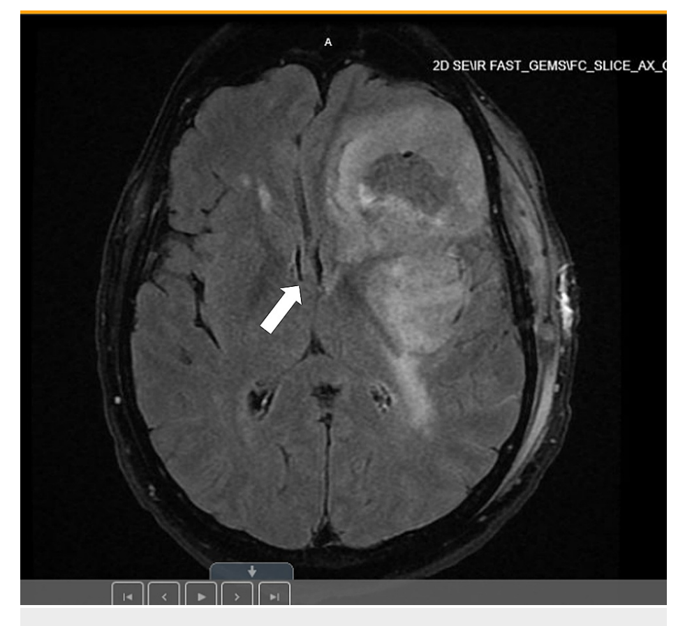
FIGURE 2: MRI of the brain demonstrates post partial resection of the large left frontotemporal tumor, with decreased peripheral contrast enhancement and decreased mass effect, resulting in diminished midline shift from left to right (denoted by a white arrow), now measuring 9 mm, compared to 13 mm preoperatively.

Postoperatively, there was initial worsening of neurological deficits, specifically expressive aphasia, followed by significant improvement. On postoperative day 3, the patient developed acute onset of right-sided hemiparesis with marked aphasia. MRI of brain showed acute left posterior, frontal, and parietal infarct (Figure 3). Given the recent brain surgery and underlying malignancy, the patient was not candidate for IV thrombosis with plasminogen tissue activator (tPA). Patient was discharged with a plan to start Stupp protocol of temozolomide and concomitant radiotherapy [6].