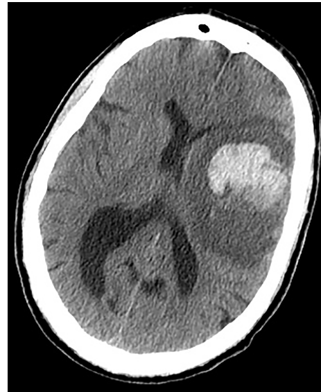
FIGURE 1 | Earlier brain CT scan of a 71-year-old man presenting with acute onset of right hemiparesis: note the disproportionate hypodense edematous area surrounding the hematoma, not in accordance with the very acute phase of hemorrhage. An underlying unknown HGG was diagnosed.

ICH can be the first manifestation of an unknown brain tumor (Figure 1) or a complication during neoplasm treatment or follow-up (Figure 2). In the former case, ICH causes acute onset of focal neurological deficits which are indistinguishable from those caused by spontaneous ICH. If not promptly differentiated, intralesional bleeding can delay neoplasm diagnosis and treatment (142). Primary brain tumors, mainly gliomas, account for 2 to 6% of all