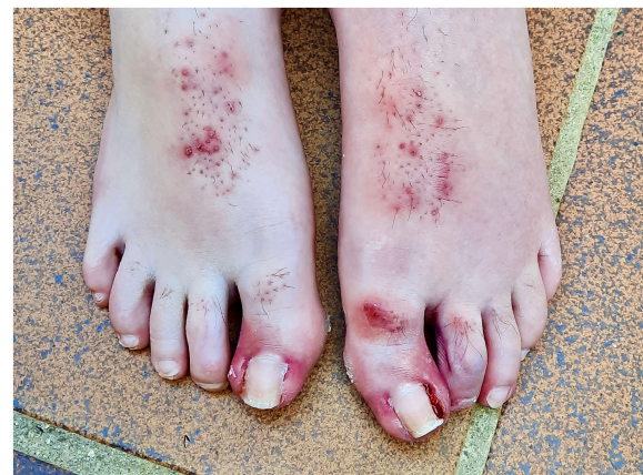
FIGURE 1 Skin toxicity in the patient showing severe paronychia in both feet.

This report displays a continuous response to reduced-dose treatment with MEK-inhibitor trametinib in a patient with an